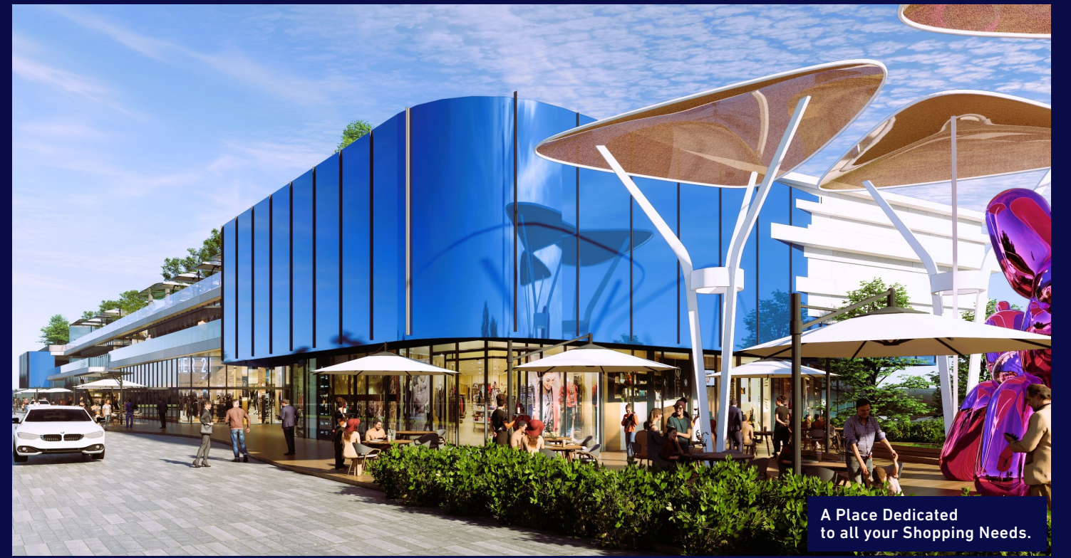
A Place Dedicated to all your Shopping Needs.