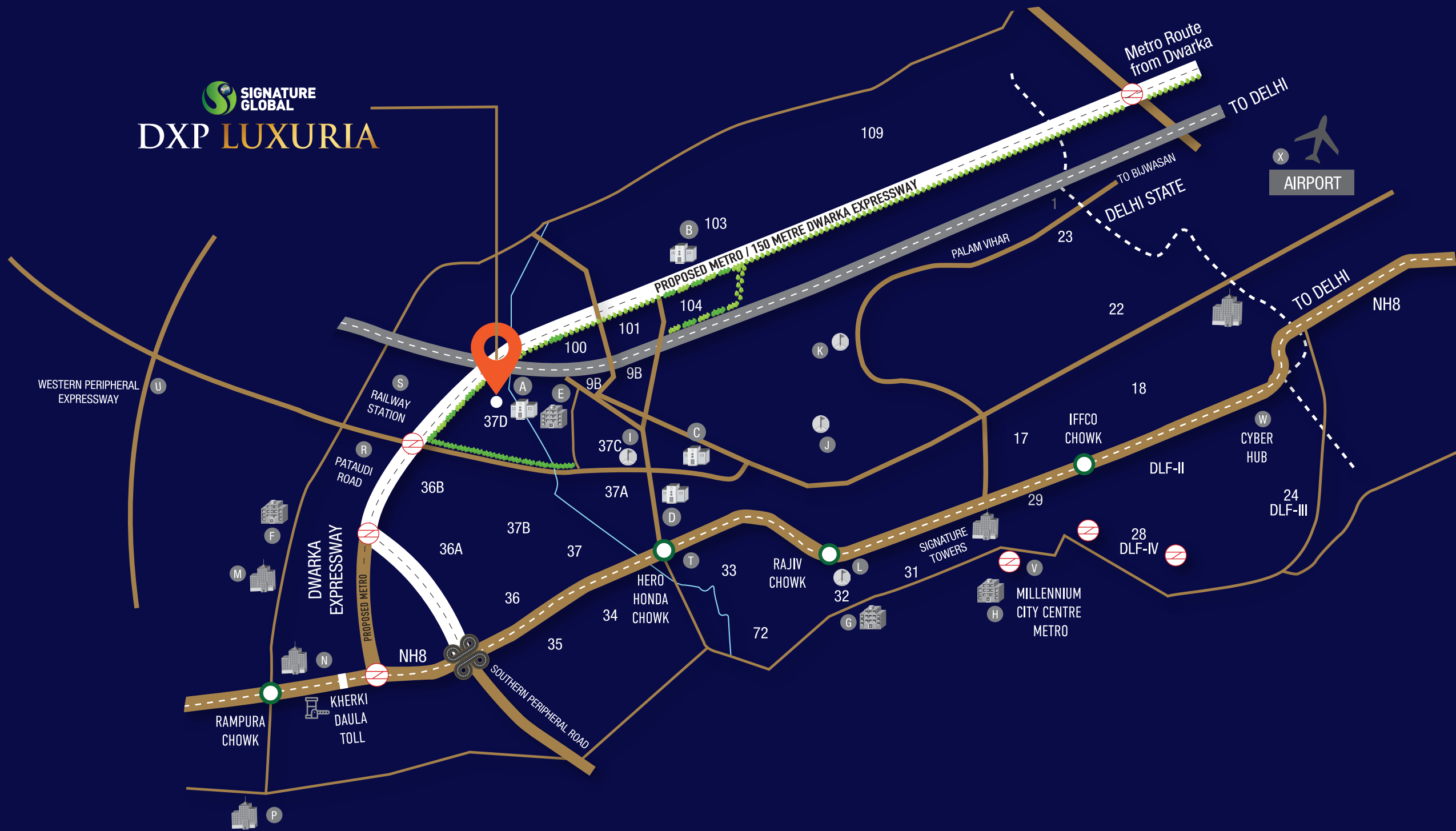
Map Shown here is based upon google maps