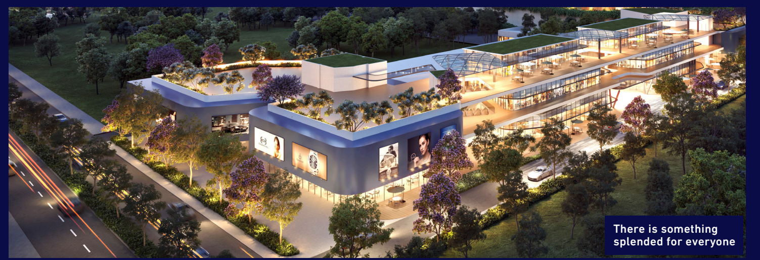
There is something splended for everyone