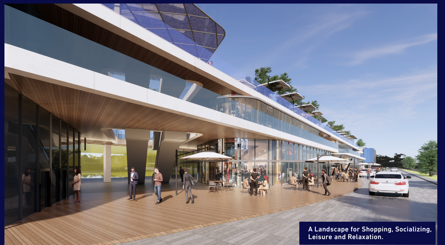
A Landscape for Shopping, Socializing, Leisure and Relaxation.